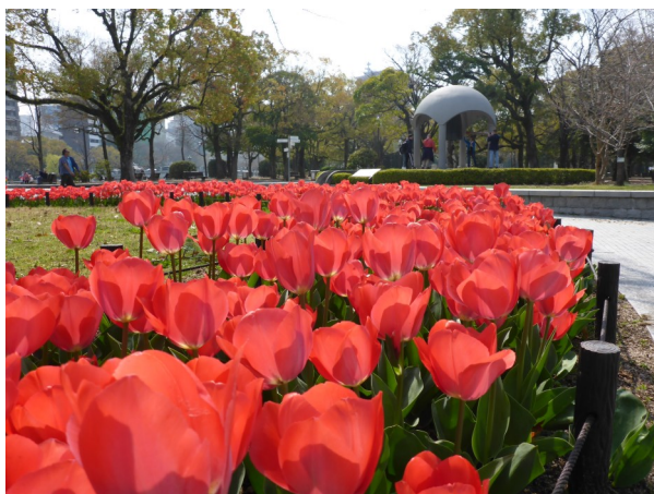
Tulips, Bell of Peace, Hiroshima, Japan by Pamela Dry

Course: Travellers' Tales Code: 8810-01 Date: 6/2 - 18/6 (first and third Tuesdays of month, Terms 1 & 2 only) Time: 2:00 - 3:30pm