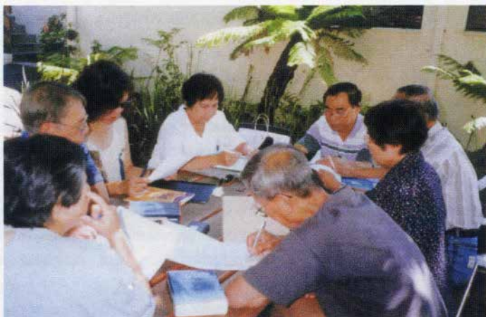
Chinese - Advanced